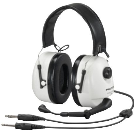
8006 MT51H79F-01 VI

Peltor Aviation 8006 headset has an ambient-noise cancelling electret differential microphone, specially designed for aviation intercom systems. The frequency range is adjusted for good speech recognition. The earphones have a broad frequency range for good sound reproduction. Straight polyurethane cord, moulded connectors and a stereo/mono switch in the branching box. The earphones are connected with a 1/4" stereo connector and the microphone has a PJ068 connector.