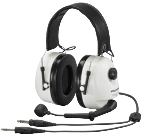
8003 MT52H79F-04 VI

Peltor Aviation 8003 headset has an ambient-noise cancelling microphone, specially designed for aviation intercom systems. The microphone amplifier can be adjusted for output signals in the range of 300–600 mV. The frequency range is adjusted for good speech recognition. The earphones have a broad frequency range for good sound reproduction. Straight polyurethane cord, moulded connectors and a stereo/mono switch in the branching box. The earphones are connected with a 1/4" stereo connector and the microphone has a PJ068 connector.