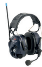
3M™ PELTOR™ WS™ LiteCom Plus