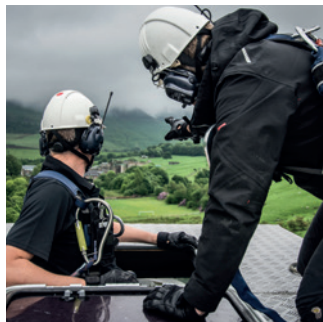
Energy and utilities