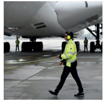
Airport ground handling