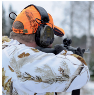
Hunting and sport shooting