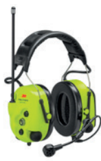
3M™ PELTOR™ LiteCom Plus