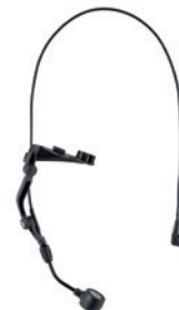
3M™ PELTOR™ MT7V/1 (DYNAMIC)