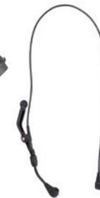
3M™ PELTOR™ MT53V/1 (ELECTRET)